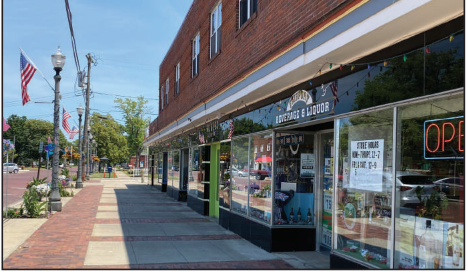
Third Street Streetscape Project

The Village certainly appreciates the continued support from the County Commissioners, the County Administrator and the Lake Development Authority as we work to make this project a reality. Looking forward to even more exciting opportunities in 2023!