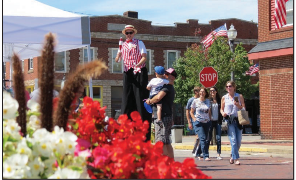
Village Fest 2019 - Downtown Fairport Harbor

Throughout the summer season the Village was alive with Summer Concerts, the Fairport Mardi Gras, Community Garage sales, Village Fest, Harbor Hogs and Hot