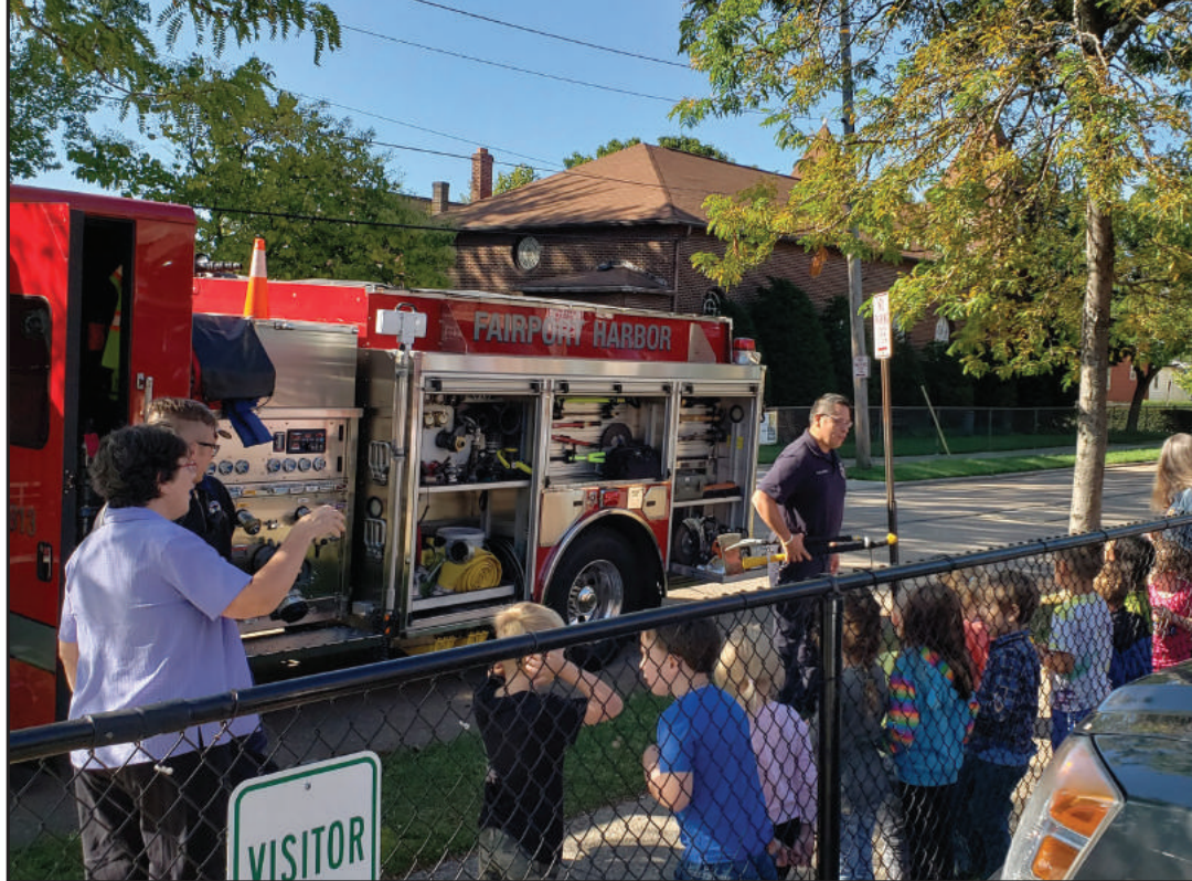
Fairport Harbor Fire Department teaching fire safety to McKinley Elementary